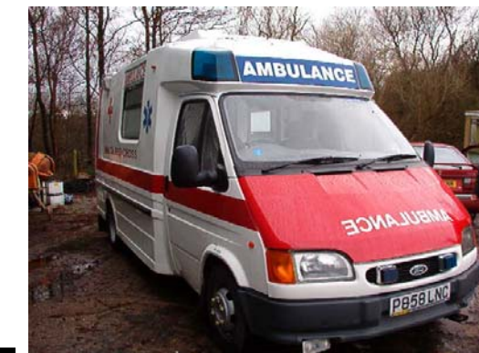
■ The Ford Transit ambulance

Due to the increase in demand and the nature of certain public events the committee has decided to get a new Ford emergency ambulance from the UK. In fact the Ford ambulance should be ready for service by mid May 2004. More information regarding this project including the official list of sponsors will be presented in the next issue of the newsletter.