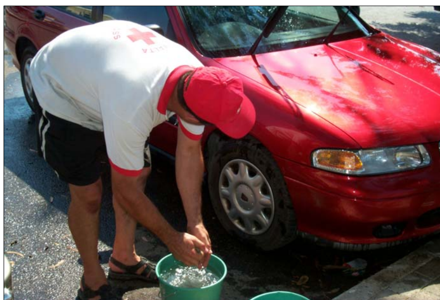
■ Car Wash