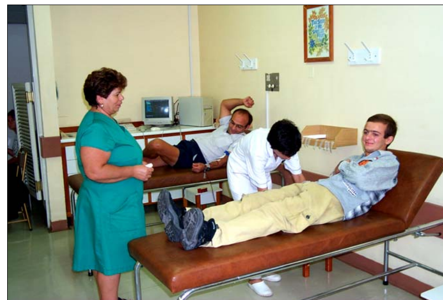
■ Members of the blood donors group donating blood