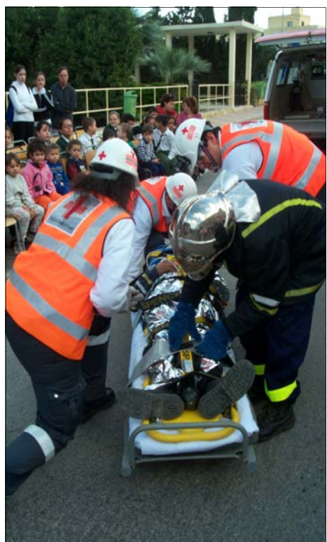
■ Demonstration with the Civil Protection Department

From the training side, we are now offering new courses to the public. These include basic first aid, basic life support and AED use. New courses are being formulated for the near future. A group of volunteers are being trained as paramedics (emergency medical technicians – basic). In fact they are doing a 120 hour course in advanced first aid and emergency medical care. The course includes some practice sessions in different areas of Gozo. Further training in disaster response and basic land rescue is being sought from several experts in the field.