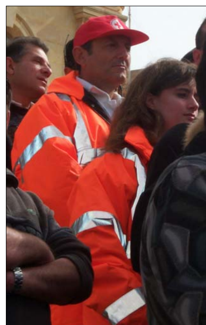
■ The Red Cross is part of the Community

For the time being this newsletter will be a bimonthly publication. It will cover several aspects of Red Cross work such as First Aid and Health and Safety. It will also serve as a photo album of local events, and International events will also have their space.