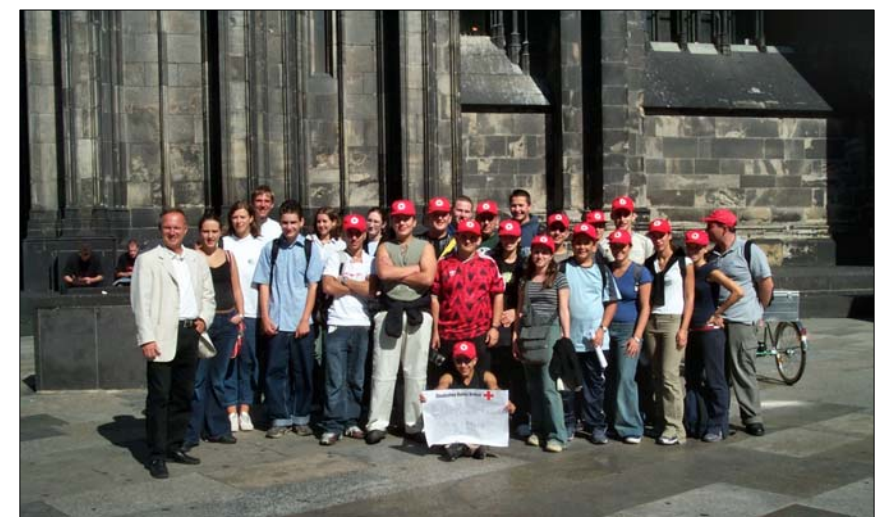
■ Youth Exchange in Germany

Our latest volunteer Robin a dog, is being trained in rescue. This is done with the aid of the Italian Red Cross. Water rescue training and beach posts were organised in summer for a group of volunteers