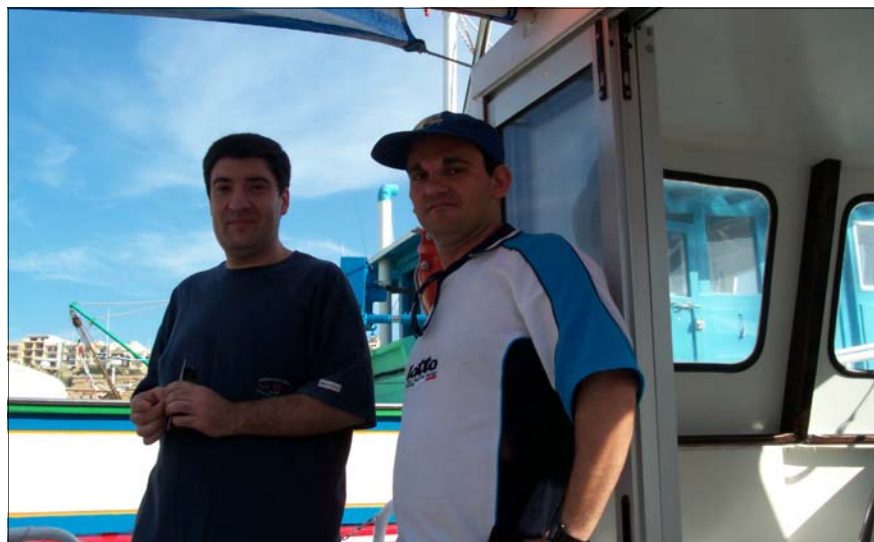
■ On the boat to Commino

The social events group did manage to organise some very good social events for the volunteers and their families. BBQ, hike on Commino, and Christmas dinner were some of the activities organised by this group. The activities organised were enjoyed by everybody concerned. These activities were also open to non Red Cross members/volunteers. More activities are being planned for the coming year 2004 such as trips abroad.