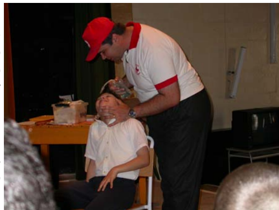
■ Demonstration at Sannat Primary - First aid