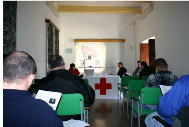
■ Branch Assembly 2004